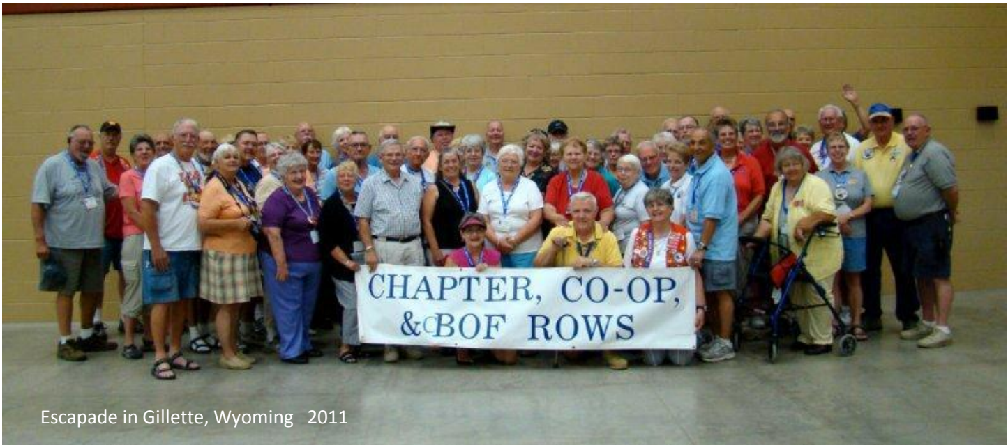
Escapade in Gillette, Wyoming 2011