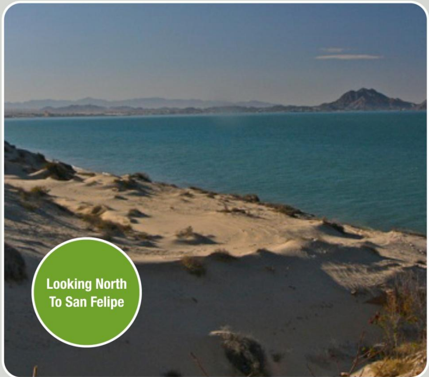
Looking North To San Felipe