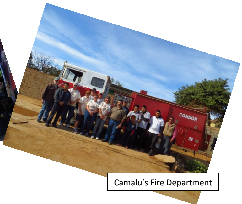
Camalu's Fire Department