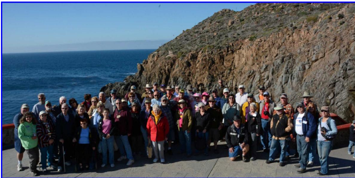
2014 Chapter 8 Rally at La Bufadora, Ensenada, Baja California