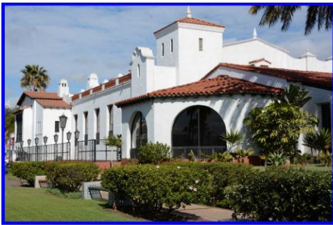
Riviera del Pacifico

Our final bus tour was to La Bufadora, the famous blow-hole south of Ensenada, along with souvenir shopping, a great lunch and a stop at the churro stands for dessert! On the way back, the whole group visited an orphanage, which was one of our Charity candidates and really enjoyed meeting the children and even playing games with them.