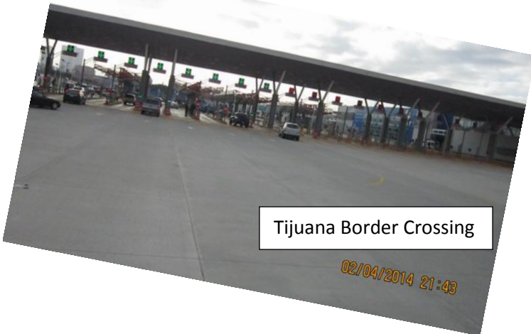
Tijuana Border Crossing