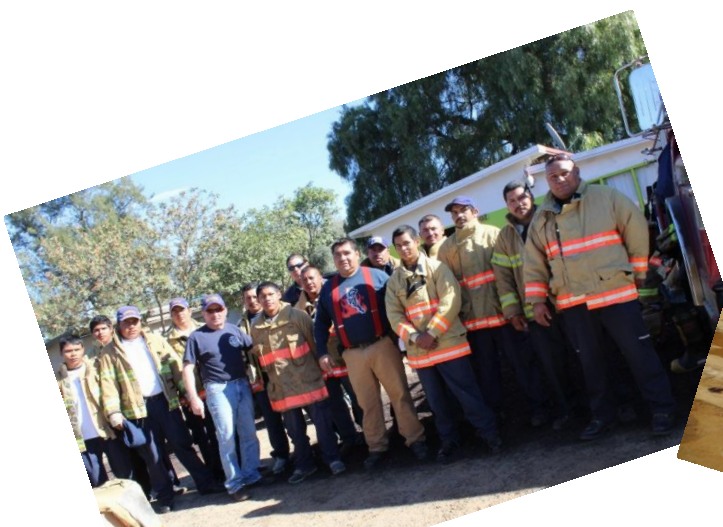
Camalu Fire Department

There is high need in Mexican Charities and low access to resources. In the case of the several children's orphanages that benefitted from our assistance, there is no government participation in their support. They are on their own to raise much needed funds, and it is often a matter of just "getting by." These institutions are doing a good job caring for children who are orphaned, or abandoned, or abused. We hope that our help will make their job just a little easier.