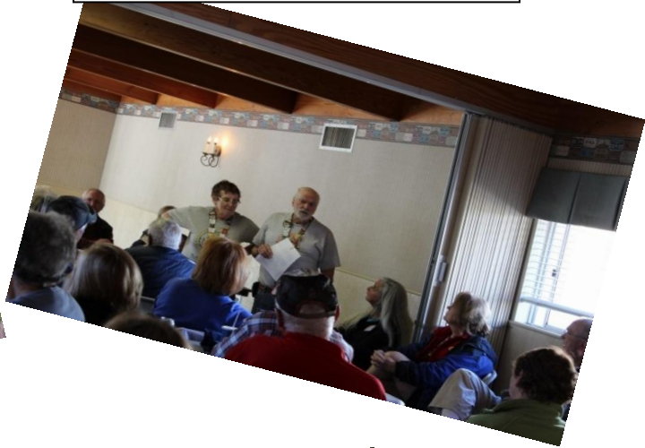
Spanish Lessons In Chula Vista, CA