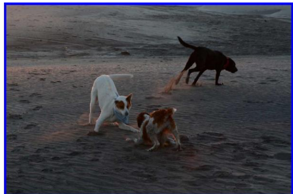
People and dogs having fun and relaxing at El Pabellon