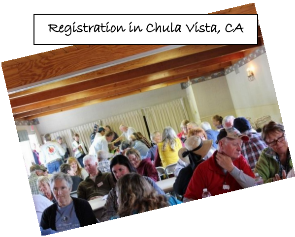
Registration in Chula Vista, CA