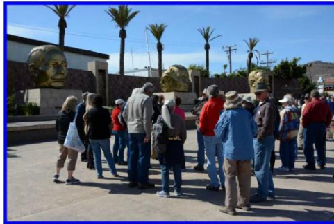
Group at the "Three Heads Plaza"