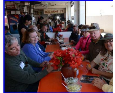
Enjoying Fish Tacos at Fish Market