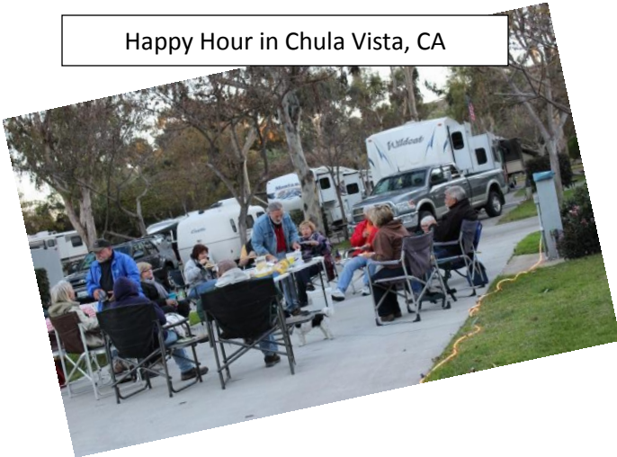
Happy Hour in Chula Vista, CA