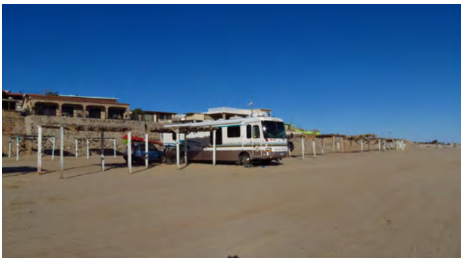
Parking on beach at Pete's Camp by Palapas

Register by filling out registration form online at mexicanconnection08.com ; hit the PayPal button and pay for your Rally; then complete registration by hitting Submit button which sends Registration to us at wagonmasters2017@gmail.com .