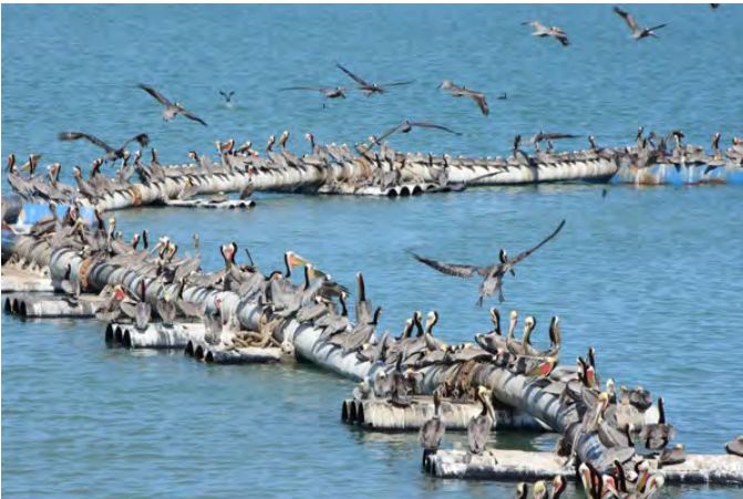
Brown Pelicans on harbor dredge pipe