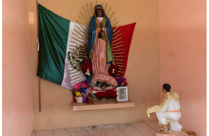
Shrine of Our Lady of Guadalupe overlooking Malecón