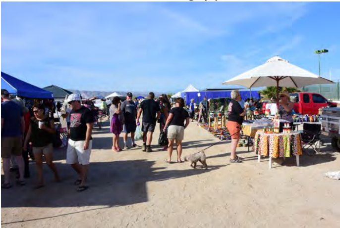
Saturday Flea market at El Dorado Ranch