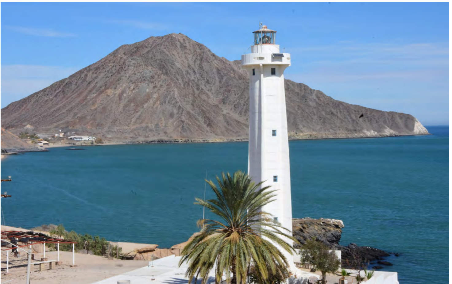
Punta San Felipe Lighthouse near Malecón downtown; tower is 72' high; visible 12 miles at sea!