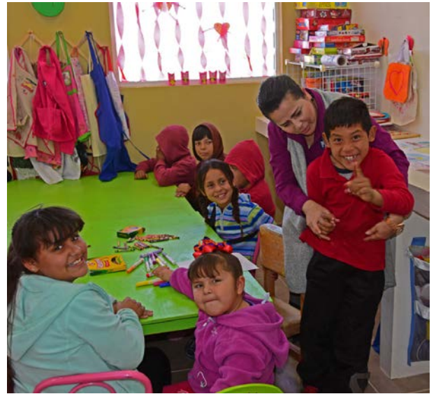
Kids working on art projects at the San Rafael Community Center