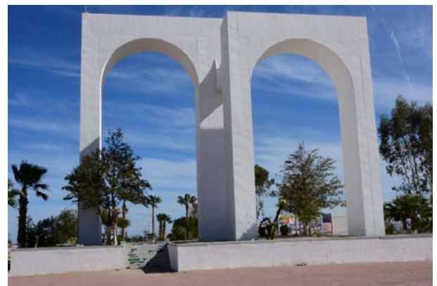
San Felipe sunrise, Los Arcos and Hobiecat