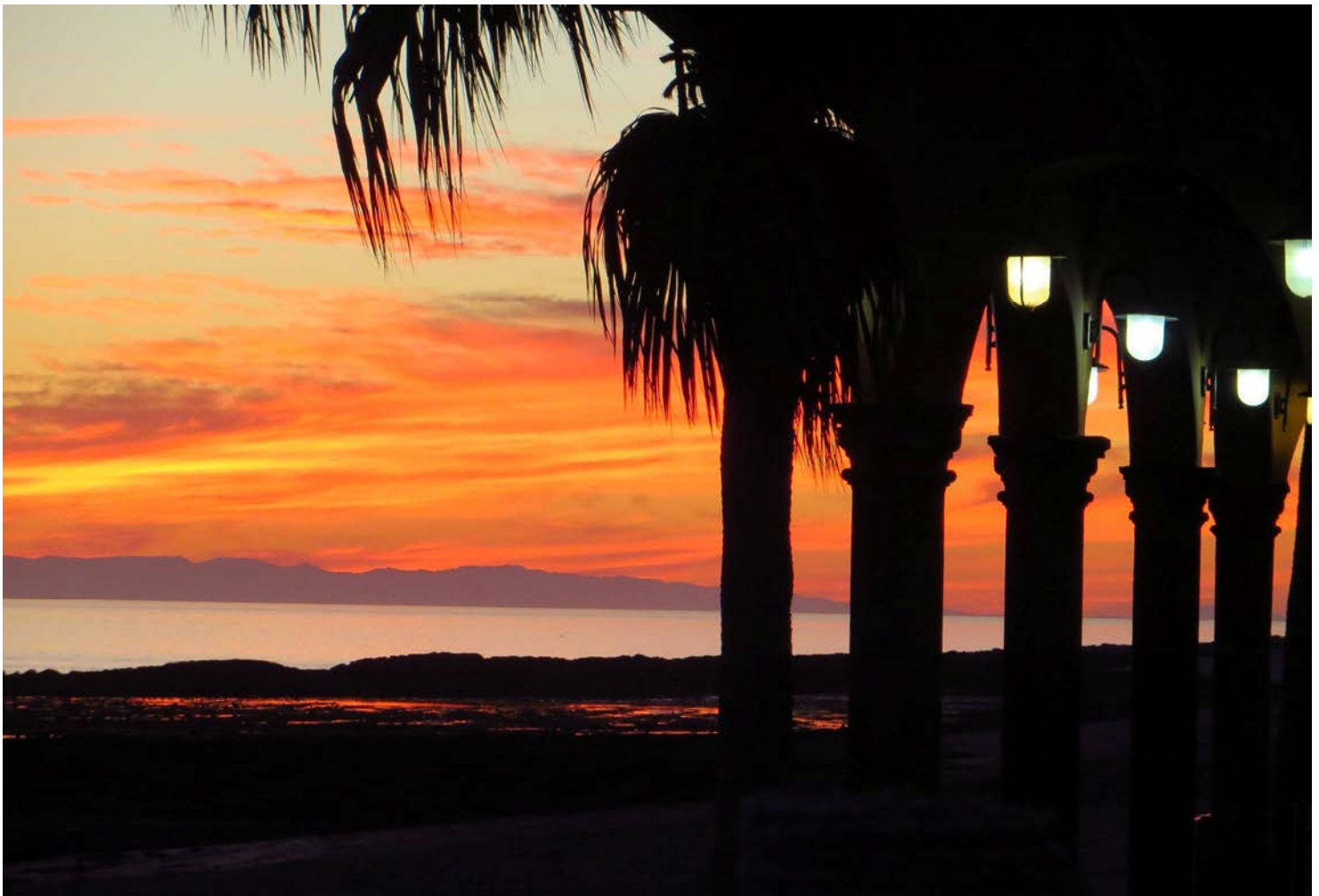
Puerto Peñasco Sunset

Spring 2016 2016 Puerto Peñasco Rally Wrapup Special Edition Volume XXXVII No 1