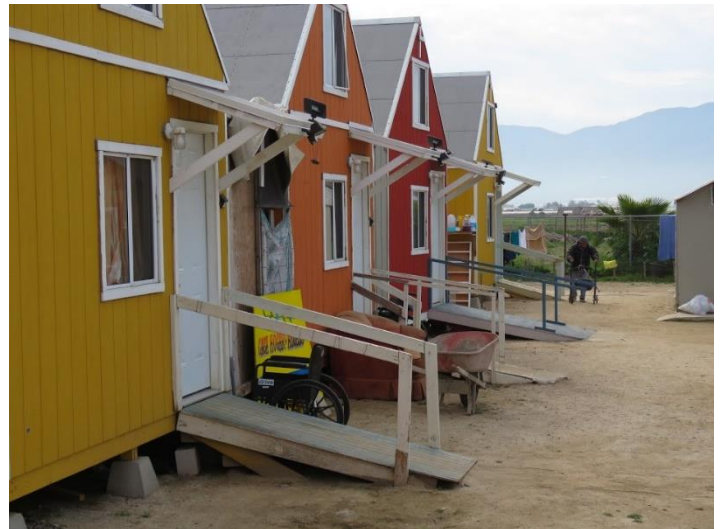
Service Project - Installing insulation in new cottages for Casa de Abuelos