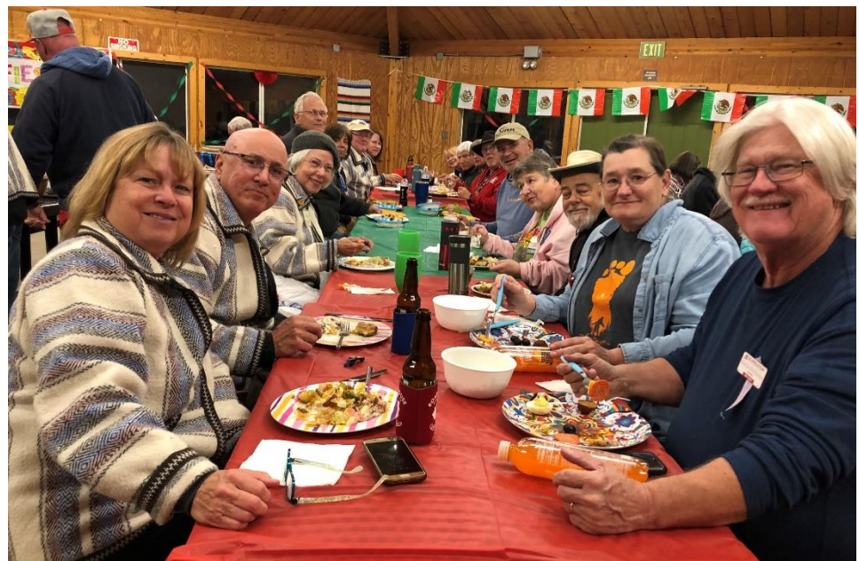
Welcome dinner at Potrero