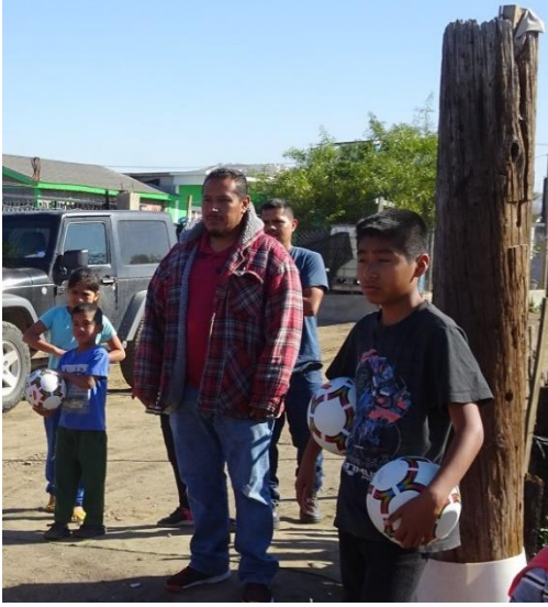
New soccer balls for migrant worker's kids