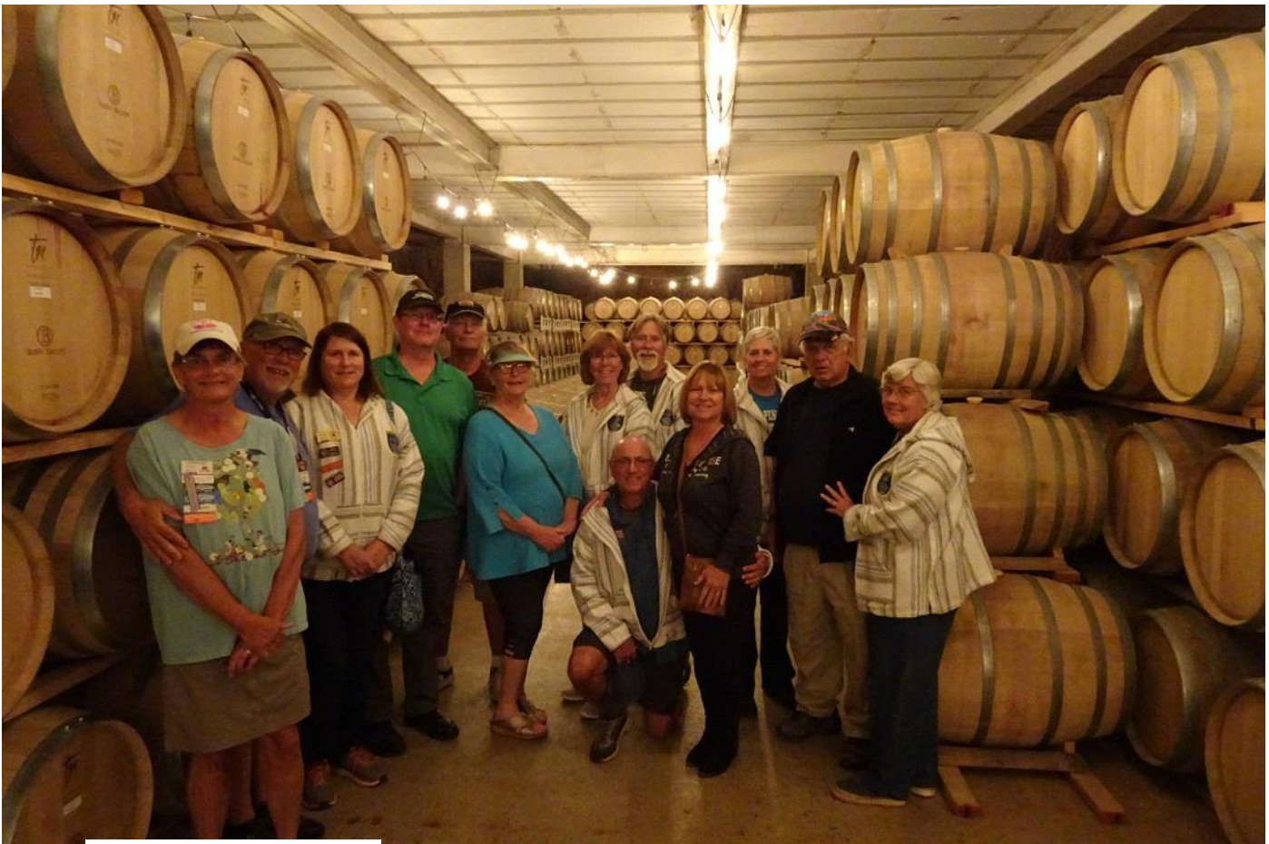
Enjoying a winery tour

We're so glad we went. The sights we saw, the experiences we had, the people we helped all added to the joy of the trip. But most of all, and what we're missing this year (because of Covid) are the renewal of the many friendships we made on the trip. As RV'ers we all have many opportunities to meet other like-minded people (other RV'ers) as we travel, but on this trip not only were we RV'ers but we were all folks that get a great deal of enjoyment from giving of ourselves in the way of our time and our talents. This was a common thread throughout the trip that bonded us all so tightly together. We look forward to the next Chapter 8 Mexican Connection rally and the opportunity to meet more great people!