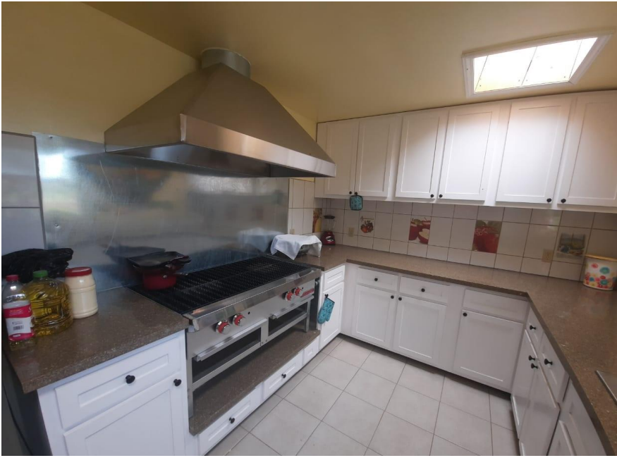
New Range Hood at Casa de Los Abuelos