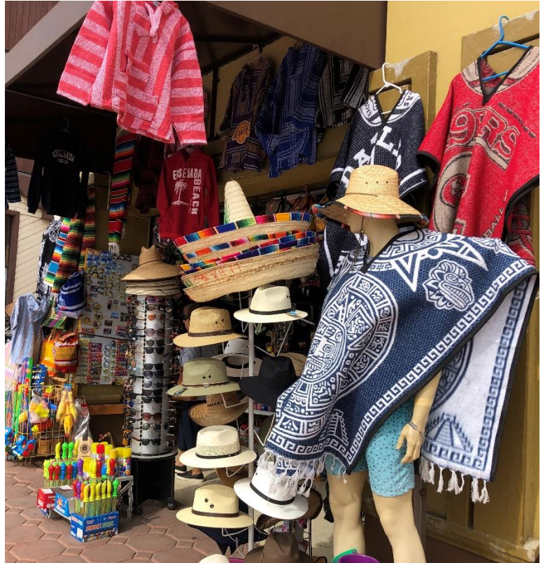
The market in San Felipe