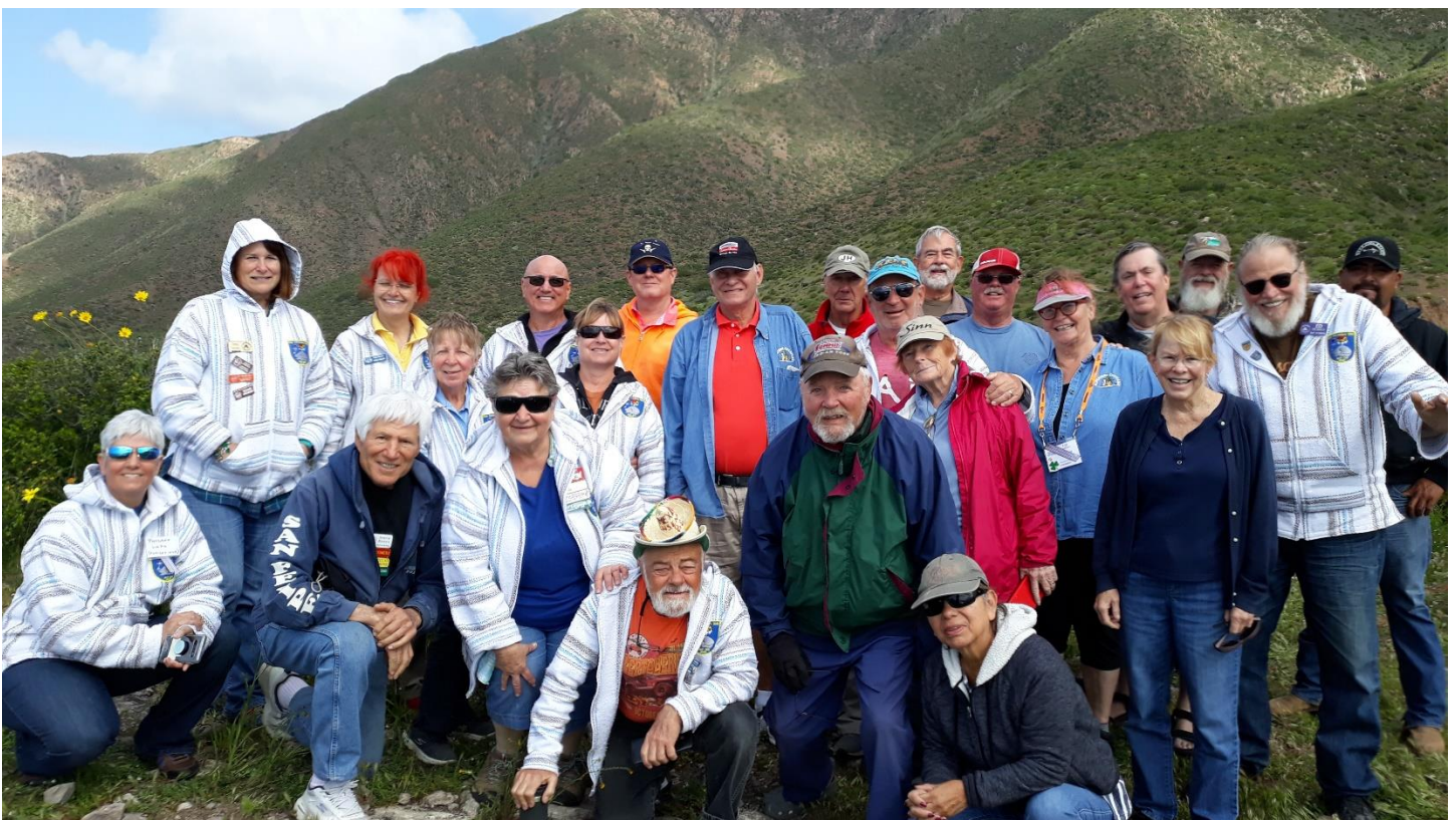
The Off-roading adventurers