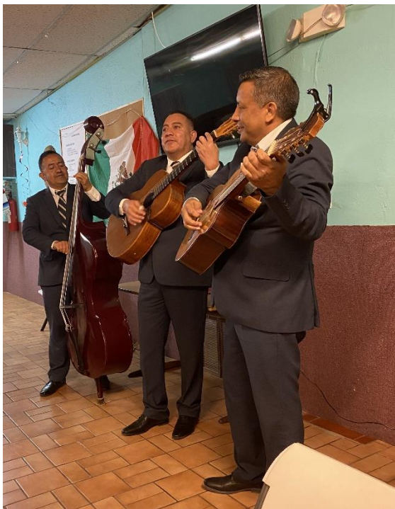
LaJolla Beach Camp Welcome Dinner entertainment

The 2020 pandemic created an unusual twist... in that RV sales are higher than ever... but most RVers seem to be isolating themselves by staying closer to home. This has created a huge pent-up demand of new RVers waiting to get out and enjoy our RV lifestyle as soon as the way is clear. Mexico is not a land where large RVs are commonplace. Thus, most Mexican campgrounds anticipate larger extended families arriving in cars and camping in tents. Most Chapter 8 campers drive their RVs or tow an RV behind them. While many tourists to Mexico are focused on "sunshine & margaritas," Chapter 8 rallies add an extra dimension to scenic wonders - Hispanic culture, local traditions, spirited festivals, and the inner joy of charitable sharing.