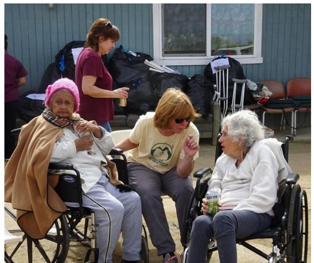
Visiting with these ladies was good practice speaking Spanish