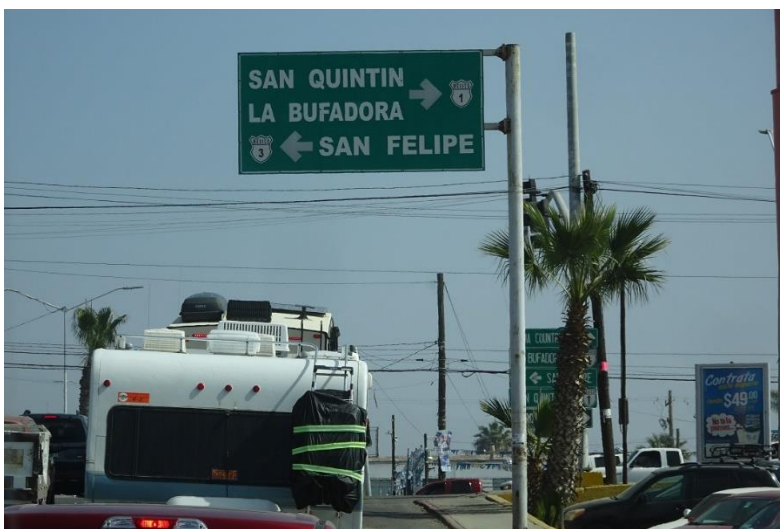
Clear traffic signs in Ensenada

The people in Mexico love to have us visit and we love giving back to the community by working with children and elderly people. The smiles on their faces when we help them is priceless.