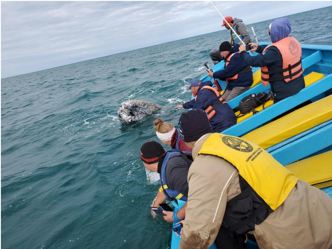
Whales up close & personal in Guerrero Negro

have done two wonderful trips to Baja Mexico and can't wait to visit this fascinating land again.