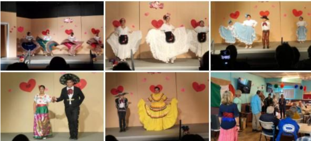
Local children perform amazing dance numbers