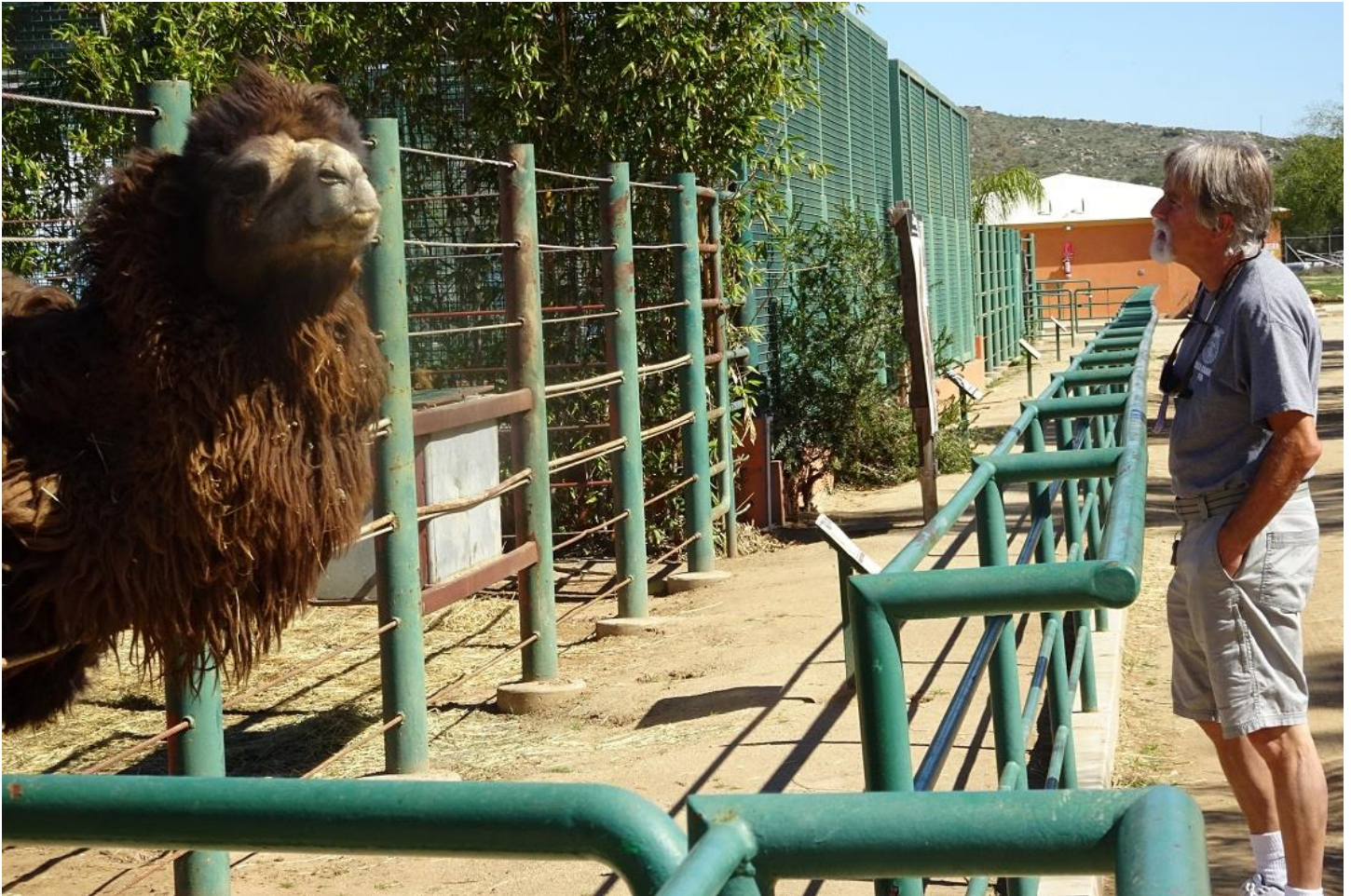
Jim communes with a friendly camel