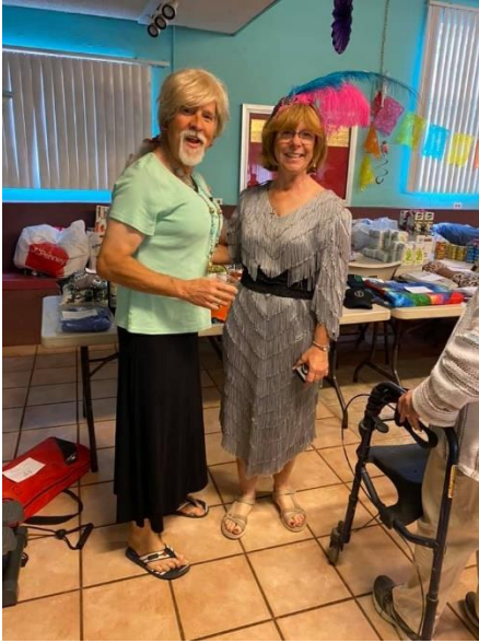
Playing "Vanna" at the Charity Auction

fresh Mexican food bursting with flavor... and who can forget Margaritas made in the land of their birth! Who could resist the wild hilarity of our Charity Auction!