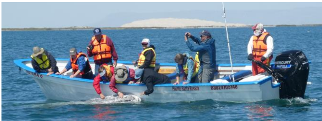
San Ignacio is the quintessential Mexican