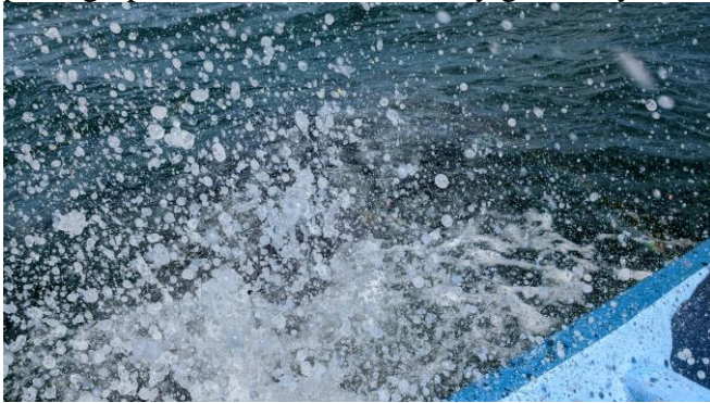
had some wet clothing!

Most of the group took whale-watching trips in both Guerrero Negro and San Ignacio. It was such a thrill, but when the whales spouted right next to the boat when they were taking photographs, this was the shot they got. They also