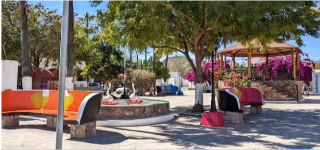
pretty plaza and great views from the overlook at