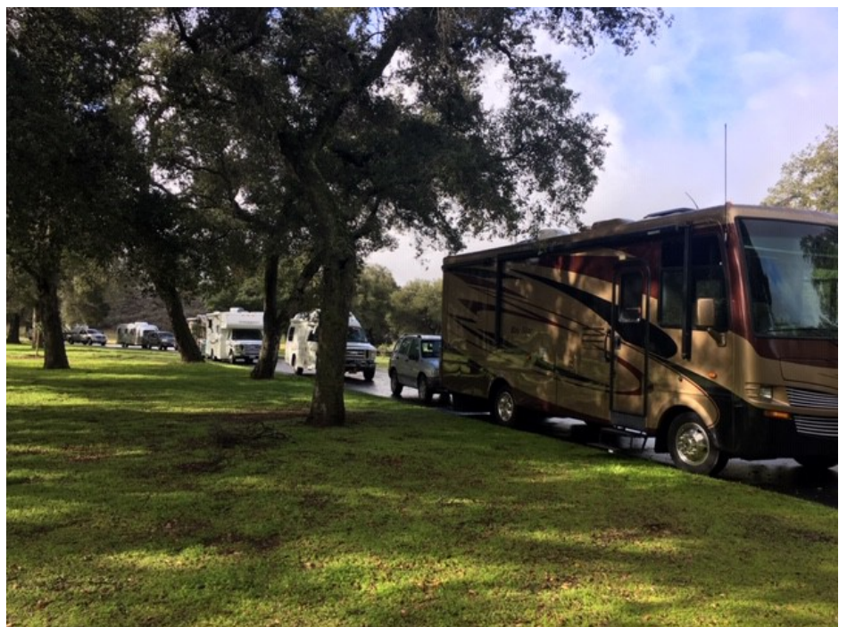
Wagonmasters ensure participants have an enjoyable time at the rally, from designing travel routes to picking what special events to attend.

The Mexican Connection website is a treasure trove of information and our Historian is combing the past to add helpful hints to Wagonmasters of the future. CB radios, Mexican insurance, preferred in-kind donation items, travelling with your pets in Mexico, updating Mexican tourist FMM and visa forms ... and so much more can be found at