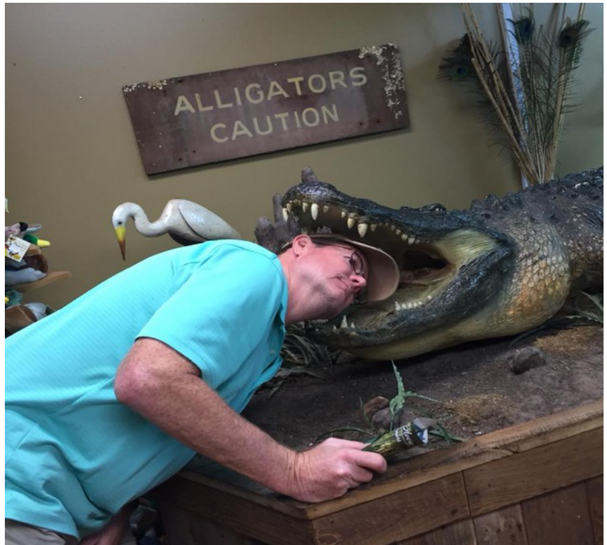
Hmmm, no internet viruses in here.