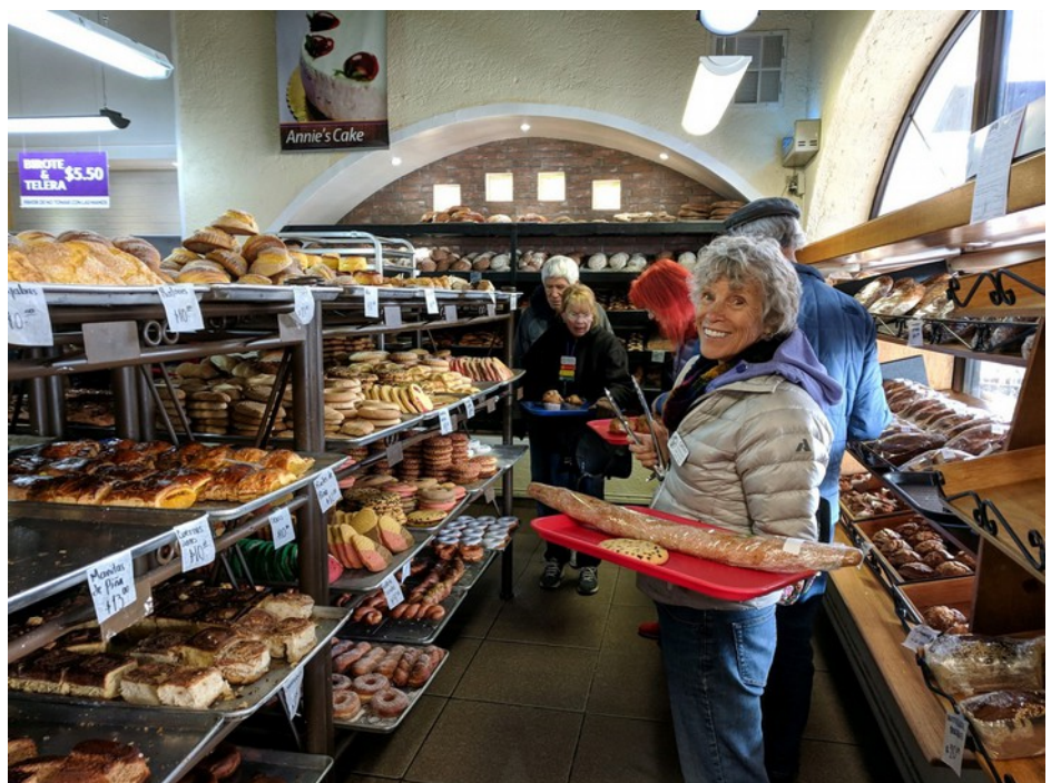
One of the Rolling Rally attendee's favorite stops was the bakery in Tecate, Baja California.

I personally want to thank each Rolling Rally participant! You guys were such a pleasure