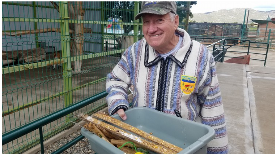
It's hard to beat the experience of preparing and delivering enrichment items at a zoo!

Finally the box was open, alpha allowed the females to get some, and even Goofy ran by and got a piece too. We all cheered. We filled long hollow bamboo sticks with peanut butter and oatmeal for the monkeys to hold and pick at.