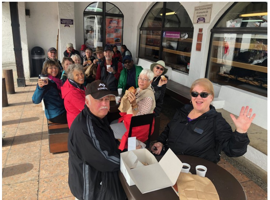
Chapter 8 members always rally around good travel, good food, and good company.

It is wonderful to have a good mixture of seasoned attendees and of newbies. As part of our mission statement is "introducing new people to travelling in Mexico" it takes both, the teacher and the student. Once again, I am just so honored by the beautiful people and their willingness to work together to make a Rolling Rally worth remembering!