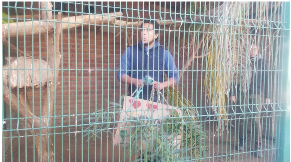
Zoo staff hang branches in an enclosure to provide naturally curious animals something to investigate.

Our chapter raised money at an auction we held while in Ensenada. This was one of the charities benefiting from that. We raised enough money to purchase a used portable x-ray machine they needed. Several of us also got ahold of a wish list, written by the enrichment team. They had on this list simple things such as screwdrivers, paint brushes, work gloves, extension cords and a few more items like that. We went to a Home Depot and loaded a couple of buckets full of items for them. We delivered these items on the way back north. They were so excited to have these things. I still get photos from them, using their new tools.