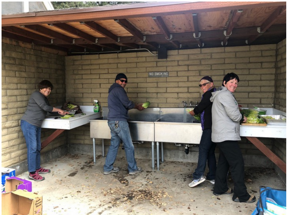
Volunteers prepare the meal for the welcome dinner at Potrero County Park.