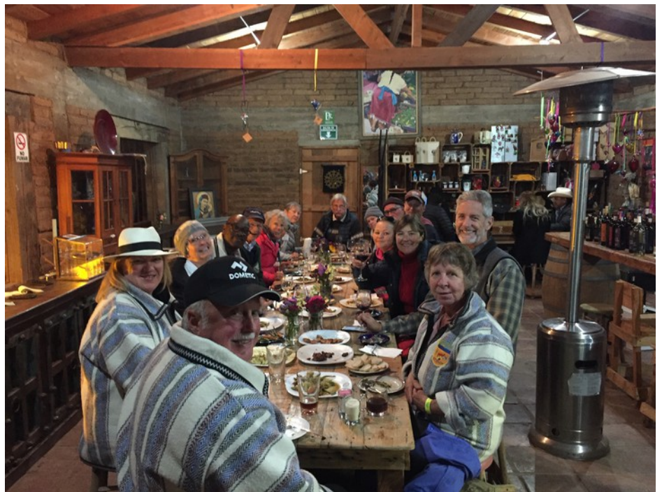
Rolling Rally participants enjoy dinner with each other, forming bonds that will last long.

As most of you know, the position of Wagonmaster 2020 is waiting for the right person or persons to carry on Chapter 8's Mexican Connection tradition. Fortunately, the adventure of Wagonmaster is usually accompanied by a team of talented folks who volunteer to do just about everything. After two consecutive years as Wagonmaster, I have been amazed at just