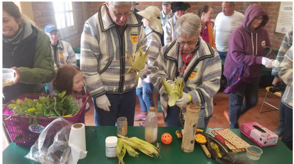
Rolling Rally participants help prepare enrichment items for zoo animals.