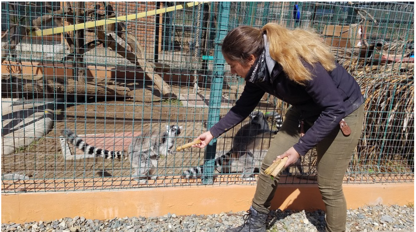
A staff member offers a ring-tailed lemur an item to play with, known as enrichment. Such items help exercise a captive animal's body and mind.

The zoo was introduced in the Chapter 8 Spring 2018 Newsletter. It is a small non-profit zoo with very humble beginnings, when the owner first accepted a camel as payment for a debt about 10 years ago. Many people would come to visit the camel. Eventually there were more animals added, plus places for all these people to relax and picnic when they came. Now it is still owned by the same family (daughter and grand-daughter of the patriarch) and is a true family