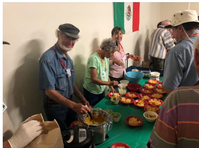
Who doesn't love nachos? This year's Escapade attendees certainly had their fill of the tasty snack.