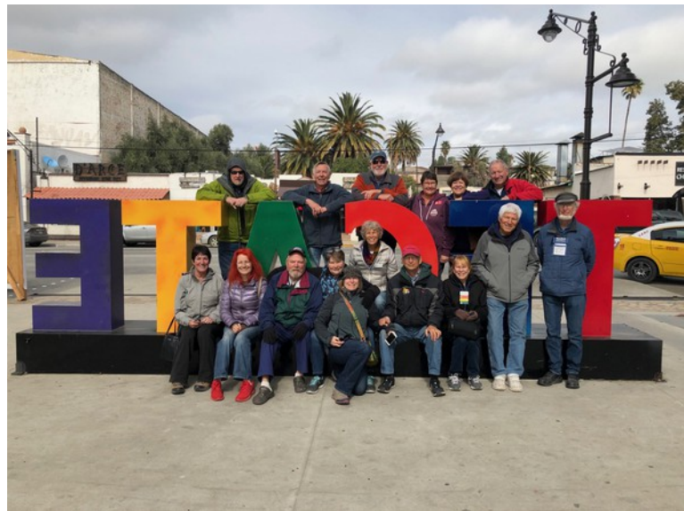
Group Leaders took a pre-trip to Tecate to help show group members everything needed to enjoy the border crossing.