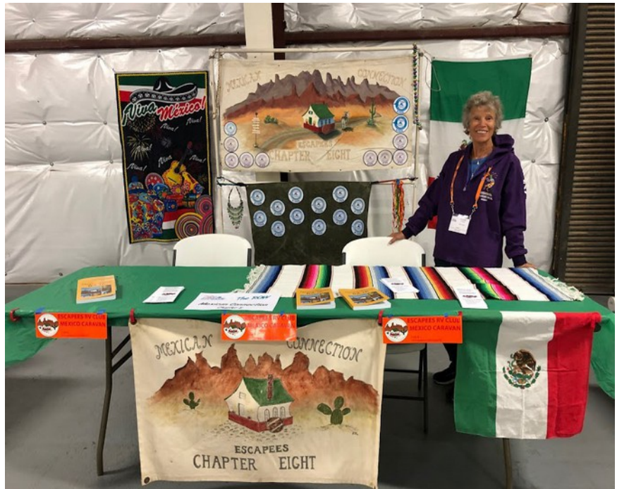
The Chapter 8 information table was quite popular during this year's Escapade.

There were too many Chapter 8 members to mention, all volunteering to help: set up, man the table, clean up and take the materials back to storage in Yuma.